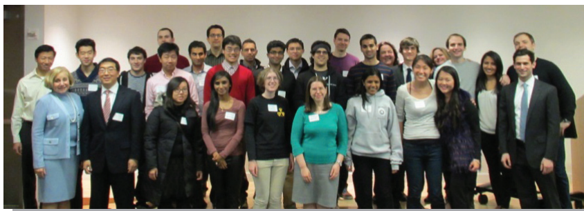
RSI Alumni at Jane Street Capital.