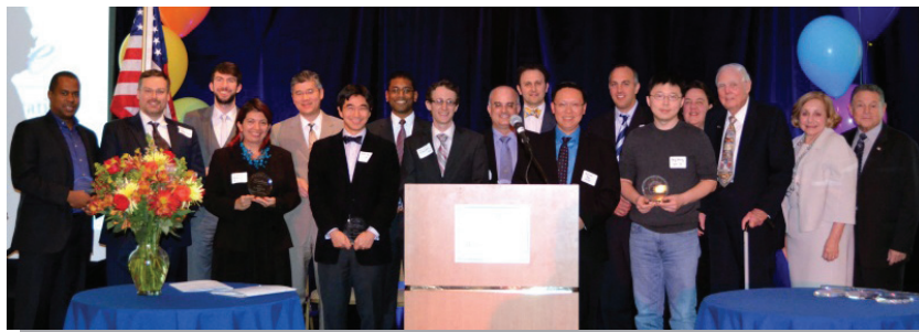
CEE's recognition to 30 Outstanding Alumni in STEM & Business.