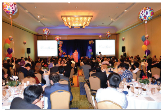
30th Anniversary Celebration of the Center for Excellence in Education (CEE).